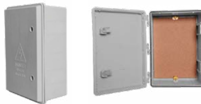
WITHOUT POLE MOUNTING BRACKET (221336)