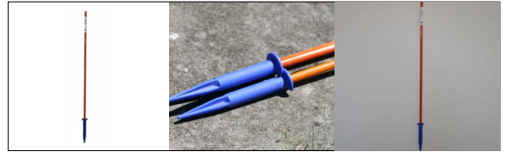
NON-CONDUCTIVE LINE MARKERS 600MM, 750MM, 900MM LINE MARKERS (600MM 102545, 750MM 102456, 900MM 102547)