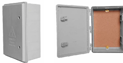
WITHOUT POLE MOUNTING BRACKET (221336)