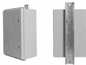
WITH POLE MOUNTING BRACKET (221337)