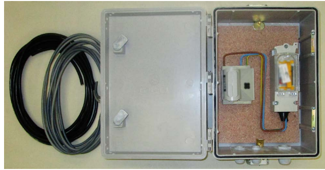
Detailed view of the parts supplied.

For more information, please refer to ESB Public lighting information bulletin No 2.