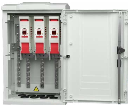
Example: distribution + protection board

750mm high x 500mm wide x 300mm deep. The overall height of this box is 816mm. The opening size is 721mm x 428mm*.