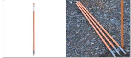
INSULATED PINS 1M FENCING PINS & LINE PINS (102544)