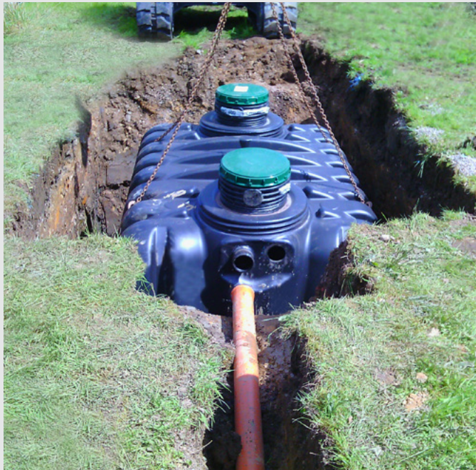
Tricel Vento installed.