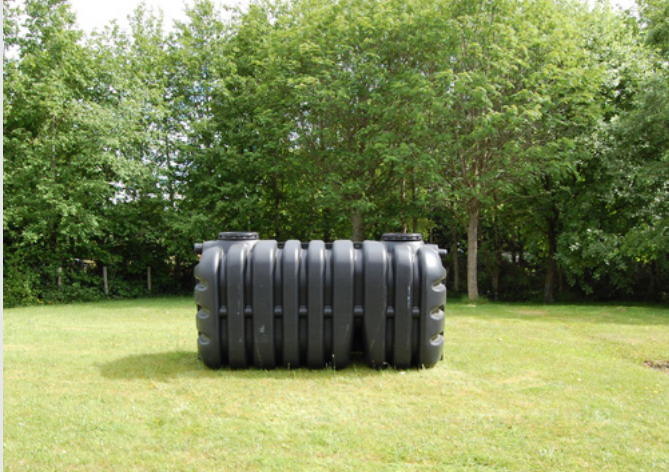
Lightweight and easy to handle.