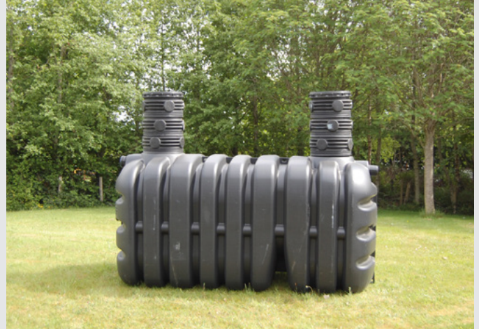
Tricel Vento with risers.